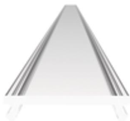
Clear (95% transmission)