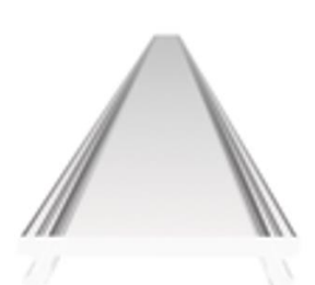
Clear (95% transmission)