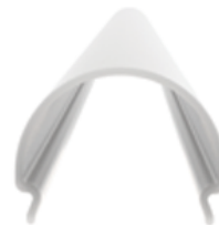
Opal round (70% transmission)