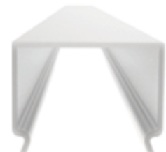
Opal Square (70% transmission)