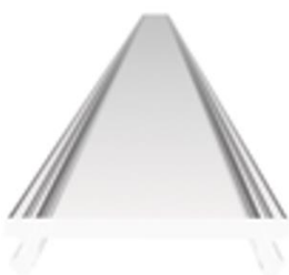
Clear (95% transmission)