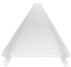
Opal (70% transmission)